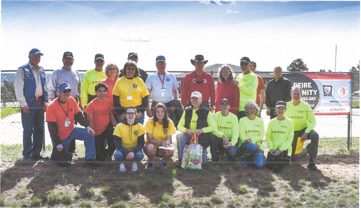
PHOTO CAPTION: Red Rock Ranch Volunteers set to deliver wildfire preparedness materials to homeowners.