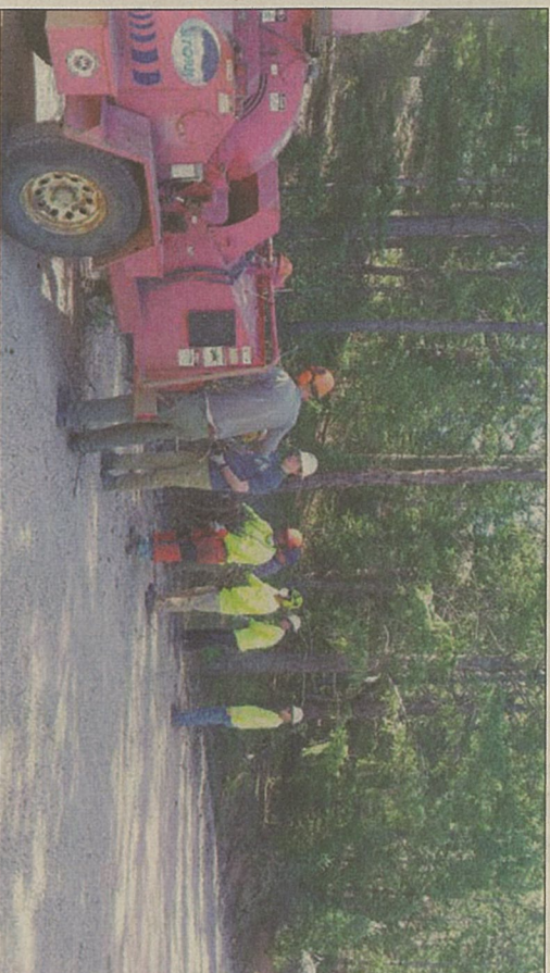
The Coalition for the Upper South Platte crew and its chipper supported the Red Rock Ranch community's mitigation efforts in September. Community efforts in 2018 included fuels reduction for 70 homes, wildfire assessments of nearly 40 homes, two community meetings and door-to-door distribution of information.

If fuels reduction so obviously saves high-risk neighborhoods, why do so many remain firetraps? Because there is no coordinated wildfire safety effort within the community. When individual homeowners go it alone, they protect their homes, but when the community works as one, the intangible things that brought residents to the woods in the first place — the beauty and sense of community — survive as well. The idea of community survival motivates Red Rock Ranch, 202 homes