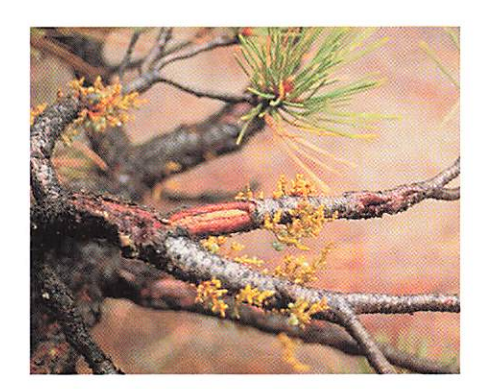
Figure 2: Lodgepole pine dwarf mistletoe plants. Note thin green-yellow shoots.

particular type of tree (i.e., lodgepole pines) and do not infect other tree species.