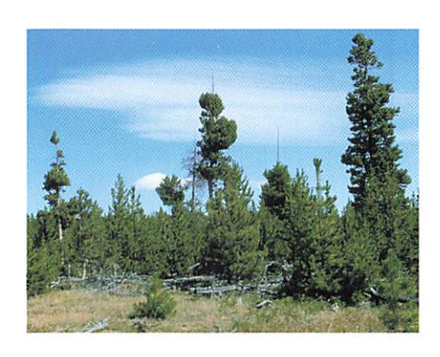
Figure 4: Lodgepole pine with witches' brooms on lower branches and dying top branches.