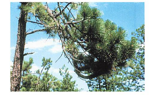
Figure 3: Witches' brooms — dense multiple branches on lodgepole pine infected with dwarf mistletoe.

Trunk infections are not as detrimental as branch infections, so their removal is not necessary. If space allows, create 50-foot buffer zones between